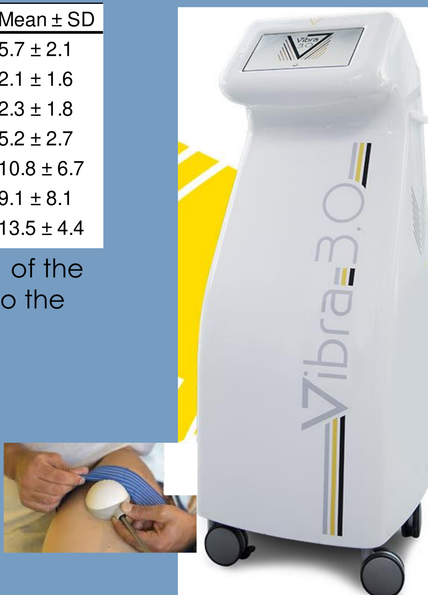
Figure 1. Vibra 3.0 system generating mechanical-sound waves stimuli able to deliver a controlled vibratory stimulation to muscles beneath the application cup (lower left corner in-picture)